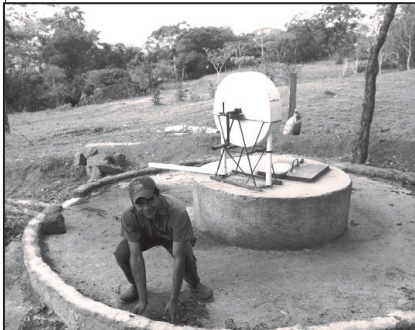
Putting the finishing touches on the well skirt, Cerro de la Cruz.