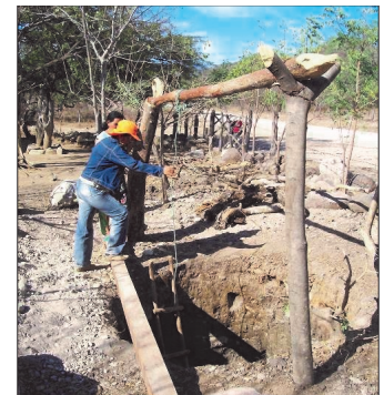
At least one person is needed at the top to pull out the buckets of dirt. Campamento, El Sauce.

Last month the air was filled with dust and plants were dry and brown. The EP truck drove on dirt roads where inches of dust slop out from under the tires and a cloud of dust marked our progress. We have been working frantically to finish projects before the rains began, knowing that the roads may be impassible and digging wells will become impossibly dangerous (see photo at left).