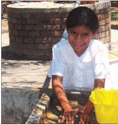
Girl at well being refurbished at San Luis school in El Sauce .

NON-PROFIT ORG. U.S. POSTAGE PAID DENVER, CO PERMIT NO. 1818